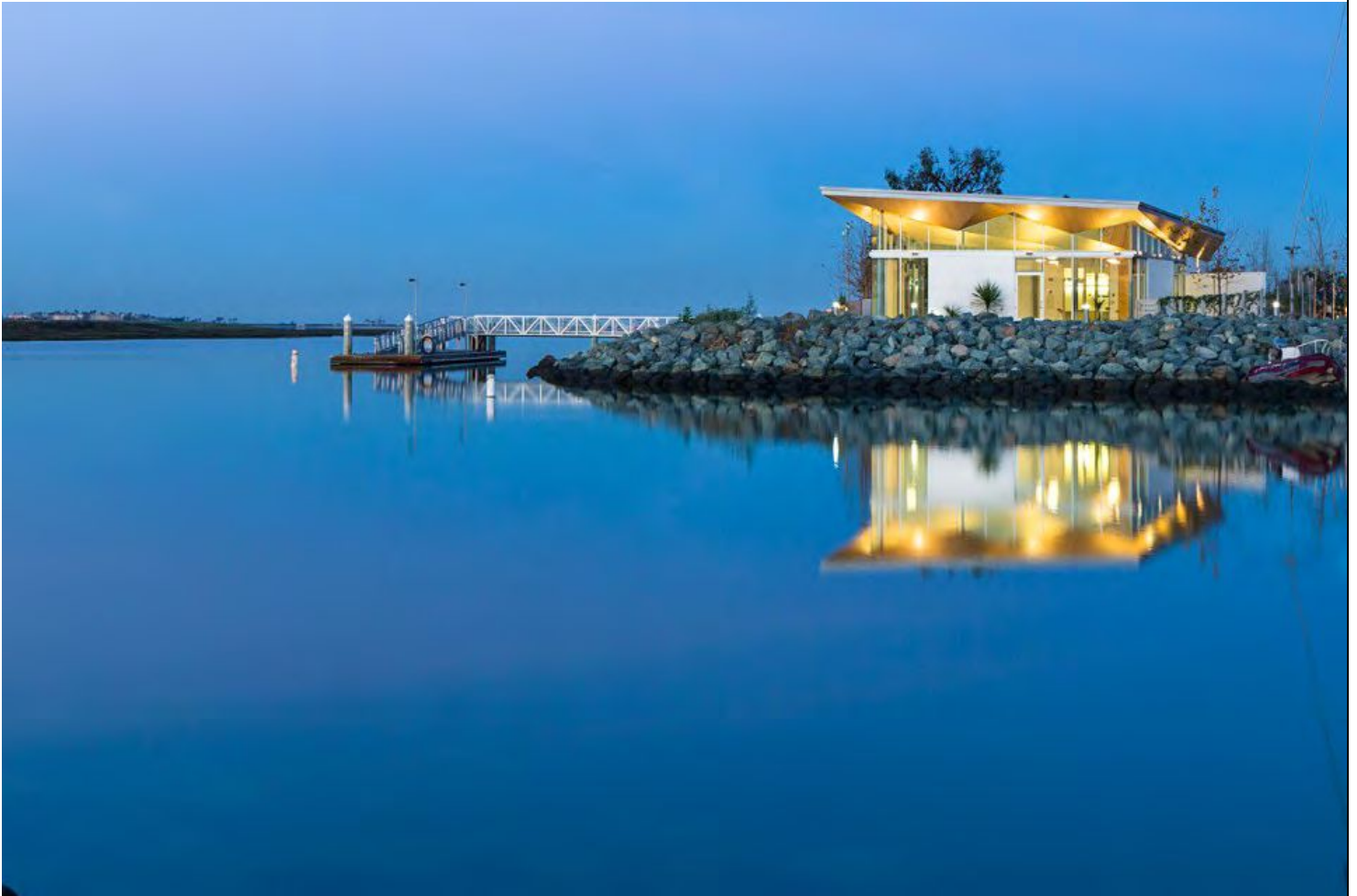
Safdie Rabines Architects, National City Aquatic Center, National City, 2016

Center, located five miles south of Downtown San Diego, California, and fifteen miles north of the US-Mexico border. The single-story, two-structure center marks the realization of National City's long-term goal to replace a makeshift facility housed in trailers for over a decade.