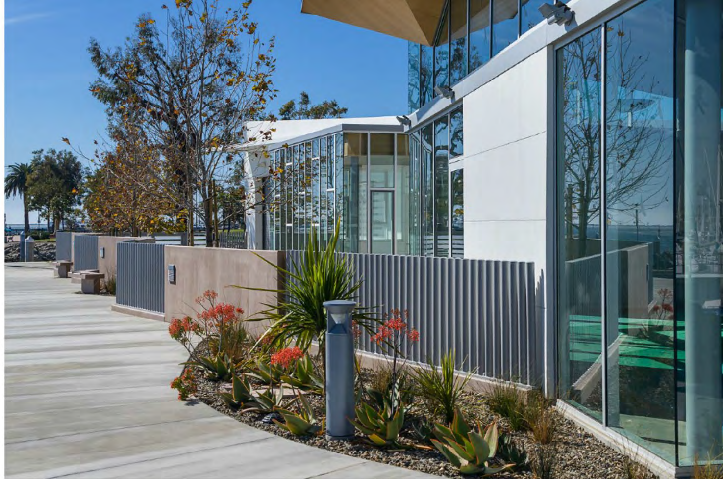
Safdie Rabines Architects, National City Aquatic Center, National City, 2016