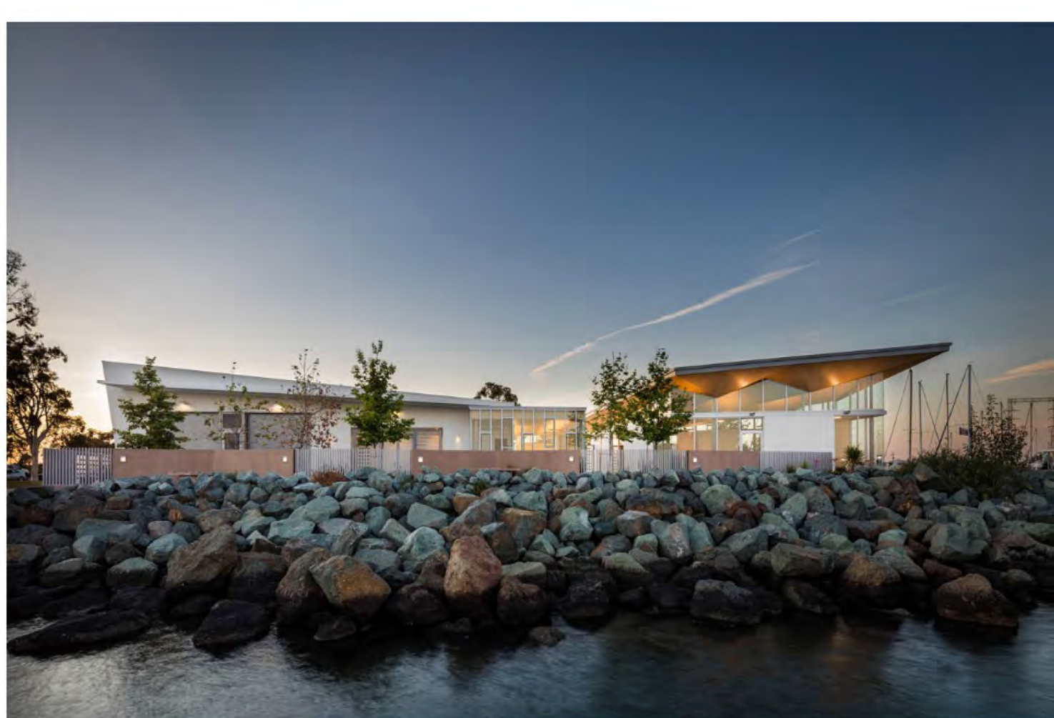
Safdie Rabines Architects, National City Aquatic Center, National City, 2016

The center's easternmost structure contains a large gathering and educational space beneath a faceted, flying roof. Perched atop its base of glass walls, the roof appears to float as kite gliding into the air, creating a fluid dynamic for its larger counterpart to the west. Inside, the geometries of a saw tooth ceiling are emphasized with maple-shaded laminate layered on micro-perforated aluminum. Carpet in ocean shades of teal, turquoise and aqua blues laid in a sunburst pattern accentuates the dimension of the space. Gull-shaped decals applied as bird strike prevention measures cast playful shadows that 'fly' through the room as the sun travels across the sky.